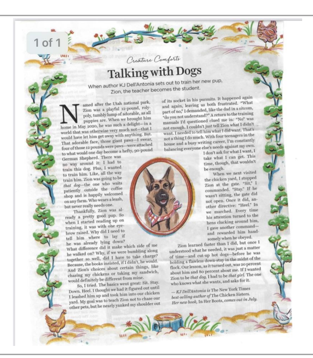
Have a blessed day